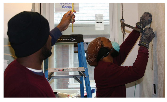
Enabling families to stay in their current homes is a key component of the City's preservation efforts. Continuing our home repair programs and homeowner property tax protections will be vital to maintaining affordability in our communities.