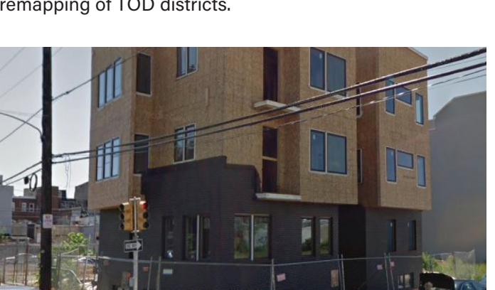
By providing publicly held properties at a nominal or below-market value in exchange for developer commitment to produce affordable housing the City can mitigate the impact of displacement in strong market neighborhoods.