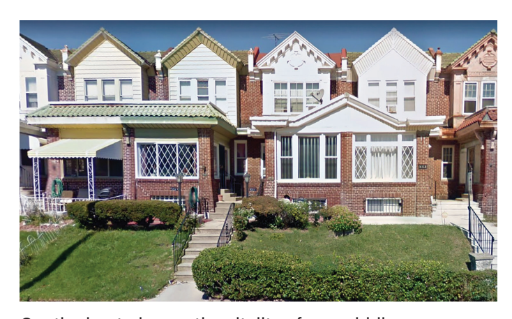
Continuing to insure the vitality of our middleneighborhoods will be fostered through the City's home improvement loan programs, closing cost assistance, and estate planning services.