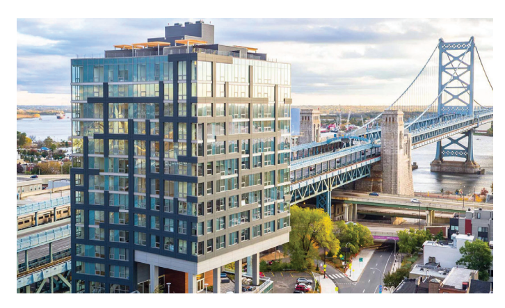
Through promoting density in strong market neighborhoods, new housing developments will continue to be encouraged to include affordable units through the Mixed-Income density bonus in the zoning code. If units cannot be accommodated on site, a developer can make an in-lieu payment into the HTF, which will be utilized to produce or preserve additional affordable housing.