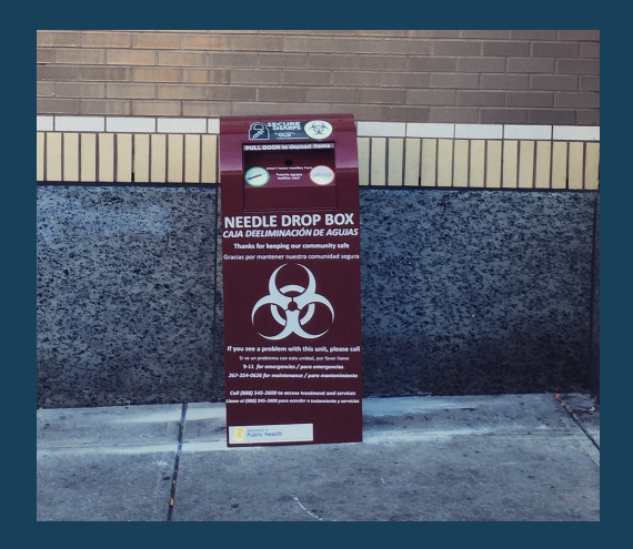
Needle drop boxes are accessible to the public 24 hours a day.

Huntingdon McPherson Square Park Somerset Alleghenv Tioga