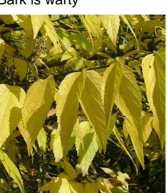
Fall leaves are yellow