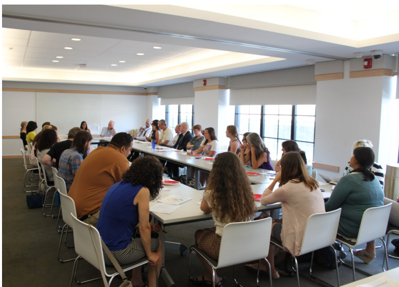
FPAC's August 2015 general meeting.