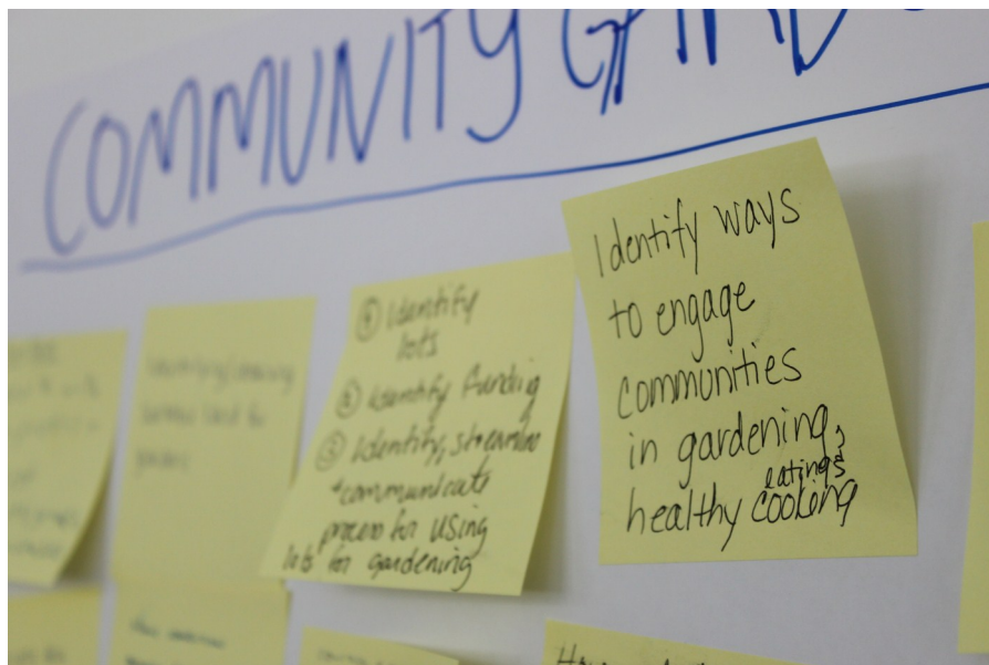
FPAC staff use sticky notes to organize feedback and policy priorities from workshop participants.

While the diversity and inclusion project led by the Communications & Outreach Subcommittee was an important step to deepening FPAC’s engagement with community members, FPAC aims to focus on long-term food policy agenda-setting through direct community outreach this year. FPAC will host a series of neighborhood conversations to hear directly from communities who experience food system barriers, including but not limited to immigrants, low-income residents, and residents with disabilities. A more robust process for engaging community members will increase FPAC’s capacity to provide policy recommendations that directly serve all of Philadelphia’s residents.