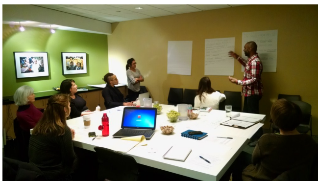
Subcommittee members develop Food & Health's mission.

Food & Health Subcommittee members are affiliated with Care Coordination Services, Food Moxie, The Food Trust, the Greater Philadelphia Coalition Against Hunger, Greensgrow Farms, MANNA, the Office of Sustainability, the Philadelphia Department of Public Health, Repair the World, St. Christopher's Hospital, and Thomas Jefferson University Hospitals.