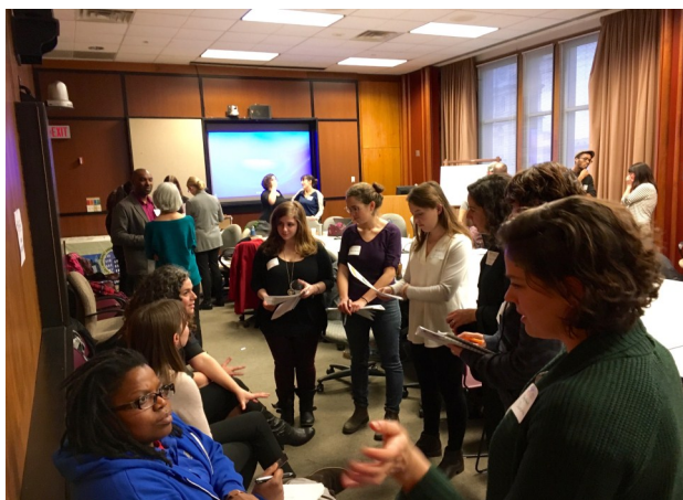
General meeting attendees participate in subcommittee speed dating.

In line with FPAC's commitment to diversity, inclusion, and participation, Communications & Outreach researched how FPAC could increase the participation of diverse community stakeholders in its work. The research was compiled into a short document with 25 recommendations under the following headings: shift who's at the table, make general meetings accessible, expand opportunities for engagement, actively engage in outreach and coalition building, make meetings awesome for everyone, remove barriers to participation, and develop leadership.