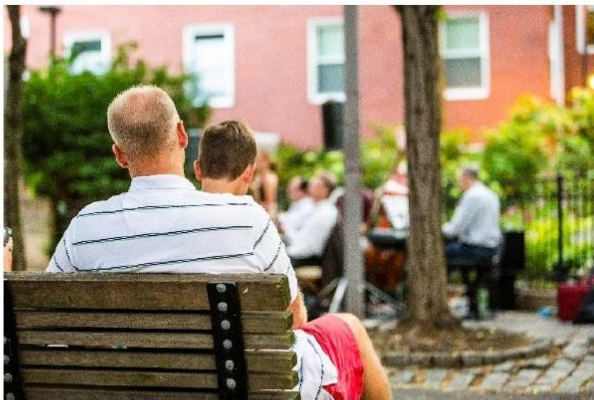
Neighborhood Park Concert at Khan Park