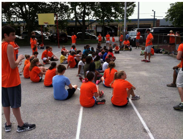
Summer Sports Camps sponsored by Eastside Baptist Church.