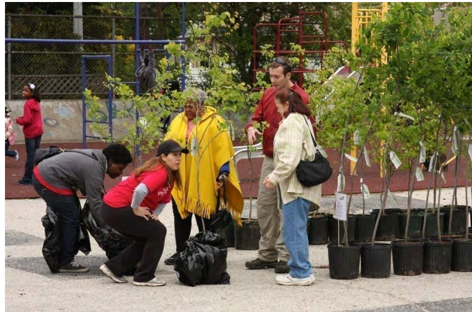
TreePhilly neighborhood yard tree giveaway