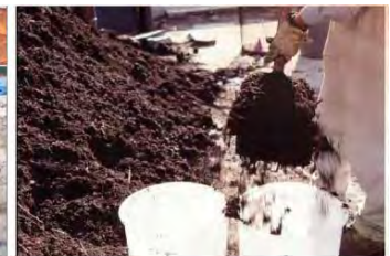
Typical finished compost