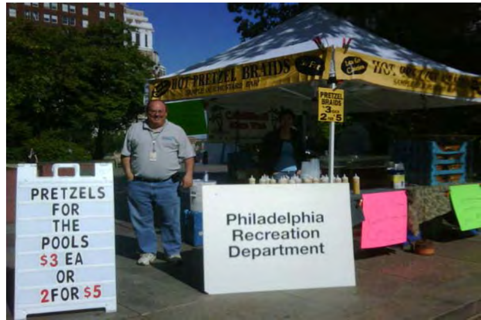
Splash & Summer FUNd community fundraising