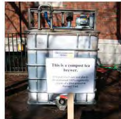
A portable compost tea brewer at Harvard Yard