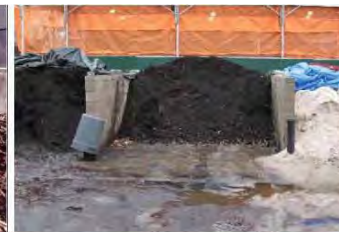
Maintenance yard sorting bins with compost and sand