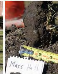
Example of turf root growth after the application of compost tea over a 3 month period at Harvard University.