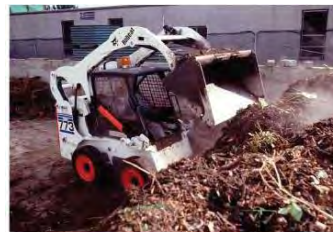
Large scale composting facility