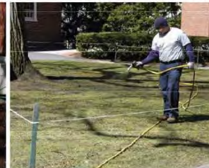
Application of compost tea at Harvard Yard