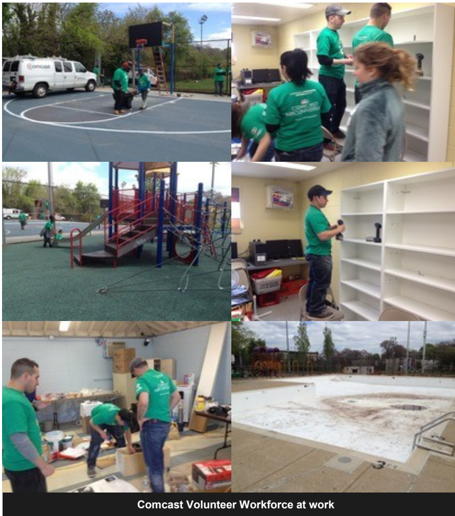
Comcast Volunteer Workforce at work