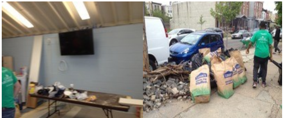
12th & Cambria Recreation Center activities room, collected debris outside center

We advocate that each and every citizen become pro-active community advocate for positive change to address a plethora of community issues that are in fact, historical issues related to the excess consequences of high unemployment, drugs, violence, destitute program activities and resources for children, teenagers, parents and senior citizens. Our Advocacy Committees essential role is to help address specific concerns related to the healthy welfare of our community! Each member has committed to continue working year to year to handle unresolved on-going issues. We have formed Ad-hoc committees that have specific assignments to help manage special short-term projects.